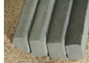
(A) (B) (C) (D)

Rock Face (D) Bevel (B) Eased (C) Bullnose (A) Demi Bullnose Drip Edge Thermal Hone Polish